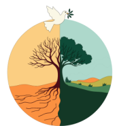
Garden of Peace Isaiah 32:14-18

For the last four weeks we have been celebrating the Season of Creation. The season began on September 1st, which is World Day of Prayer for the Care of Creation, and ends tomorrow on the feast of St. Francis of Assisi. This year's theme for the season has been 'Peace with Creation' and the children have enjoyed spending time each day with OneLife Music, taking part in short celebrations of the Word to celebrate and be thankful for God's wonderful creation.